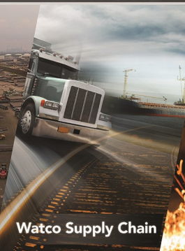
Watco Supply Chain