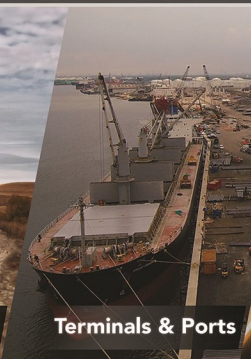
Terminals & Ports