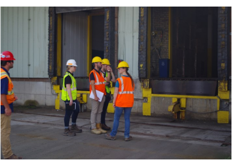
Students study logistics facilities at UP Paper

evaluated the city's aging rail system, and proposed improvements, to increase capacity at UP Paper offer new rail access points for the city. The resulting plan would provide improved traffic flow for road and rail transportation modes, with the potential to industrial growth in the city of 3,000 residents.