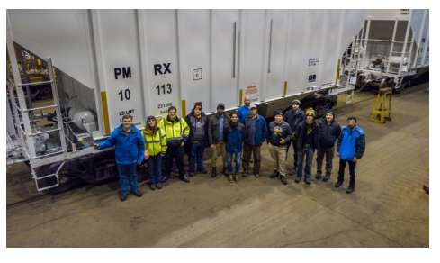
Escanaba on the Fall Field Trip